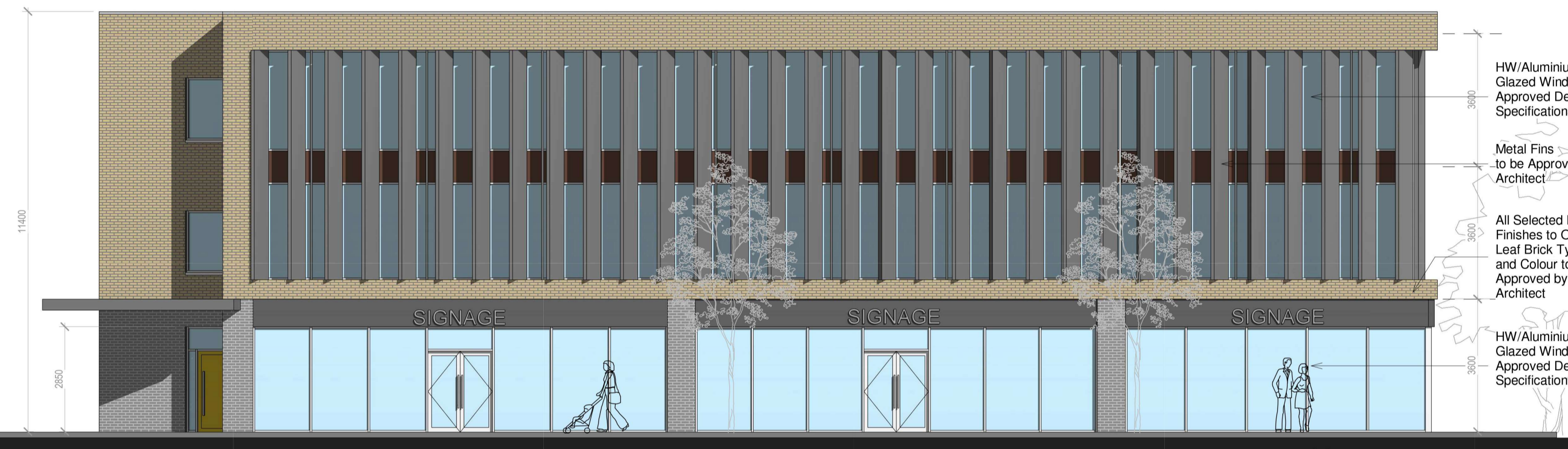
3 FRONT ELEVATION 2 (WEST) 1:100