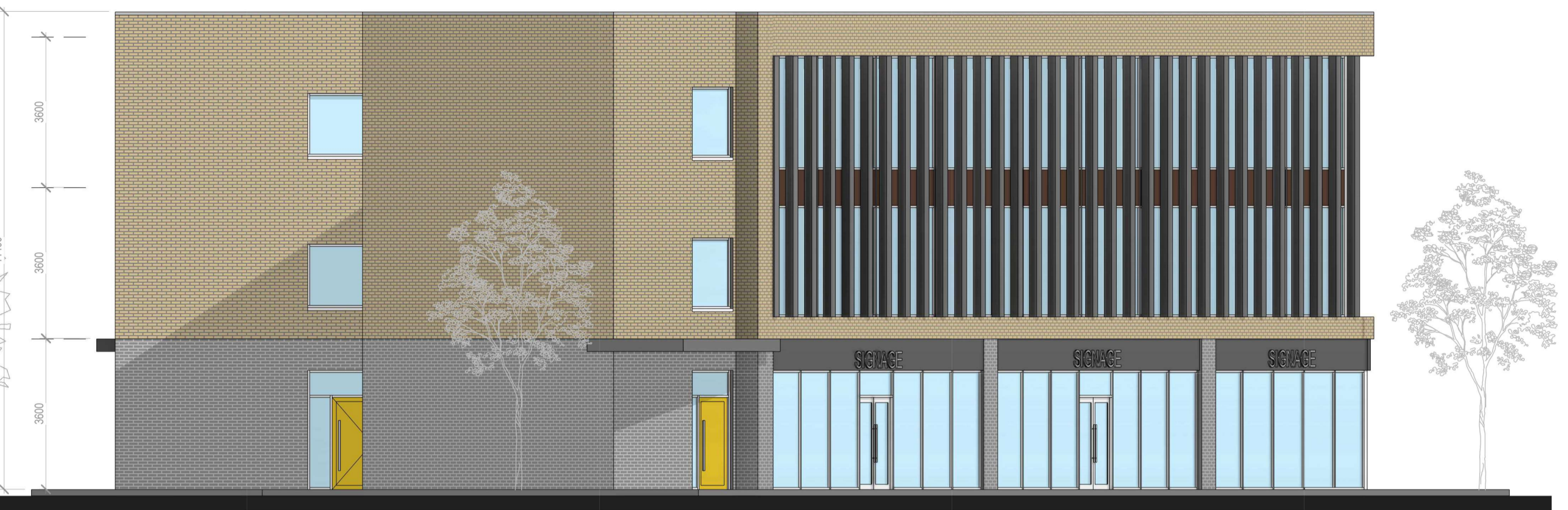
2 SIDE ELEVATION 1 1:100