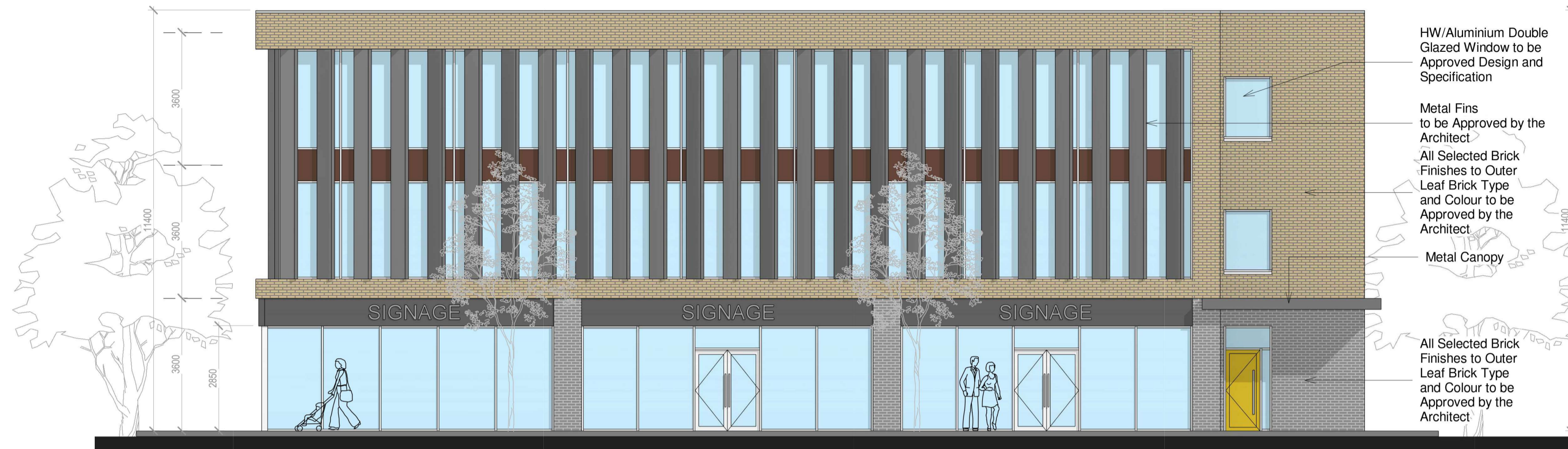
1 FRONT ELEVATION 1 (SOUTH) 1:100