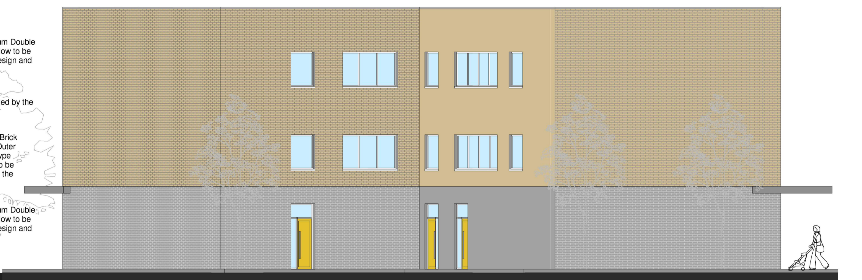
4 REAR SIDE ELEVATION 1:100