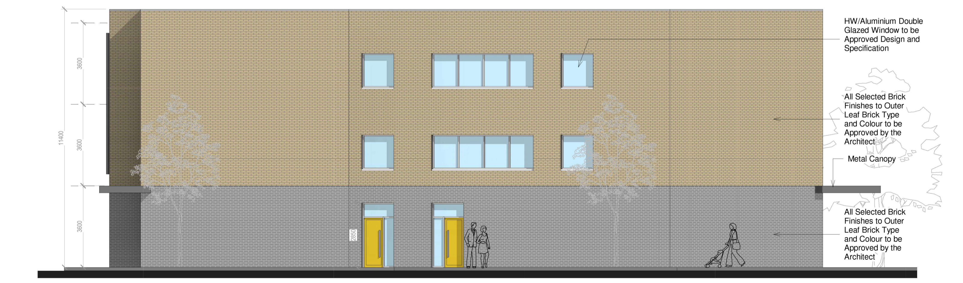
5 SIDE ELEVATION 2 1:100